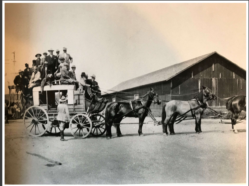
Stagecoach at the ranch