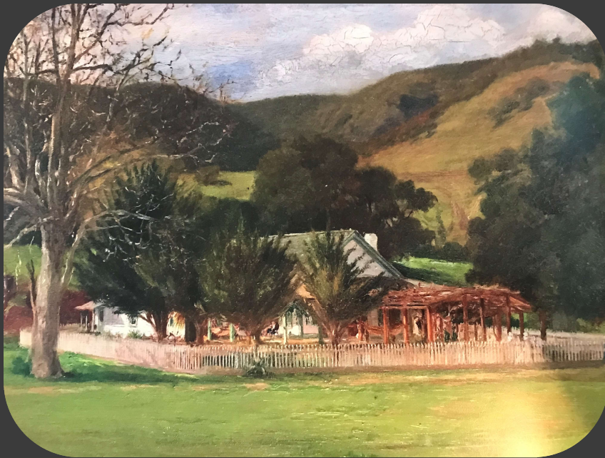
Painting of the Adobe at Rancho La Vega built in 1853