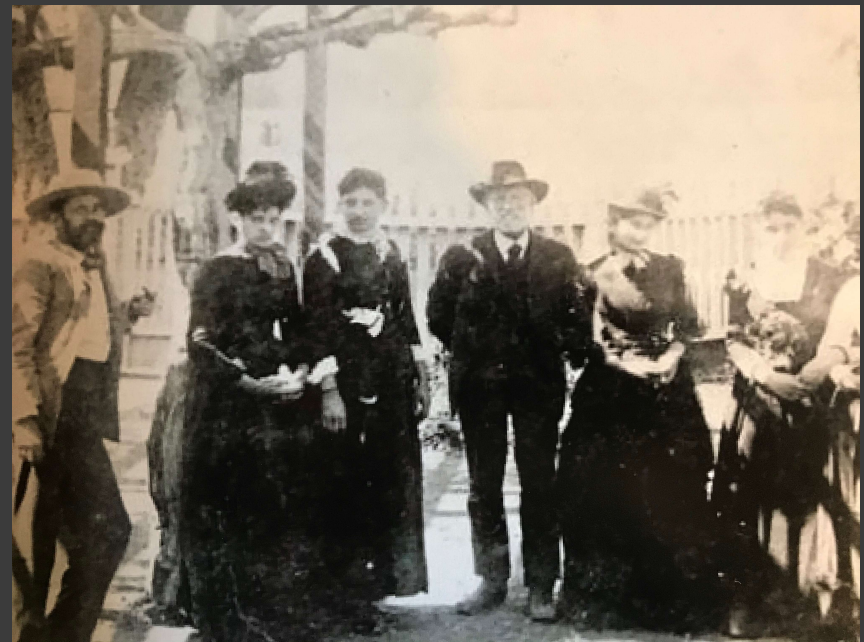
Members of the de la Cuesta Family pose underneath the Old Grape Arbor, leading to their adobe home 1892.