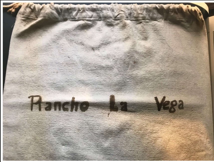
Mail bag for the ranch