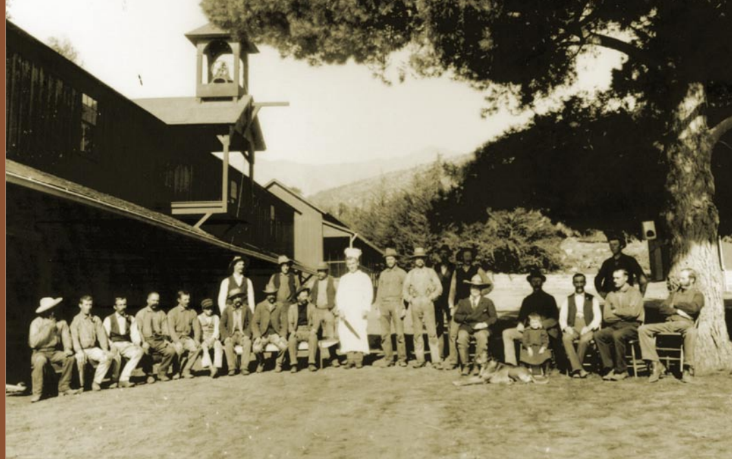
top: Hopkins House circa 1886 "The Center of The Ranch"